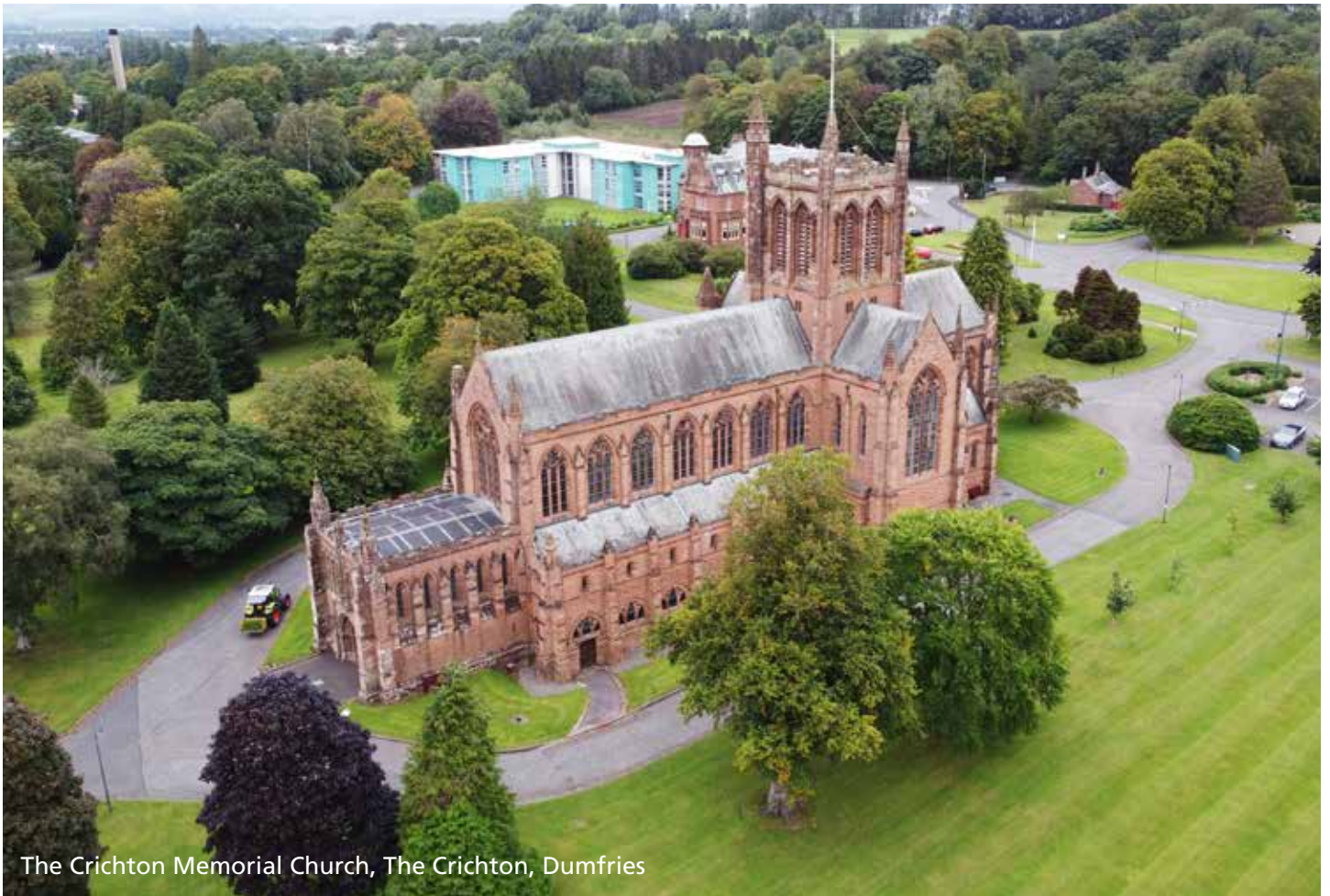
The Crichton Memorial Church, The Crichton, Dumfries