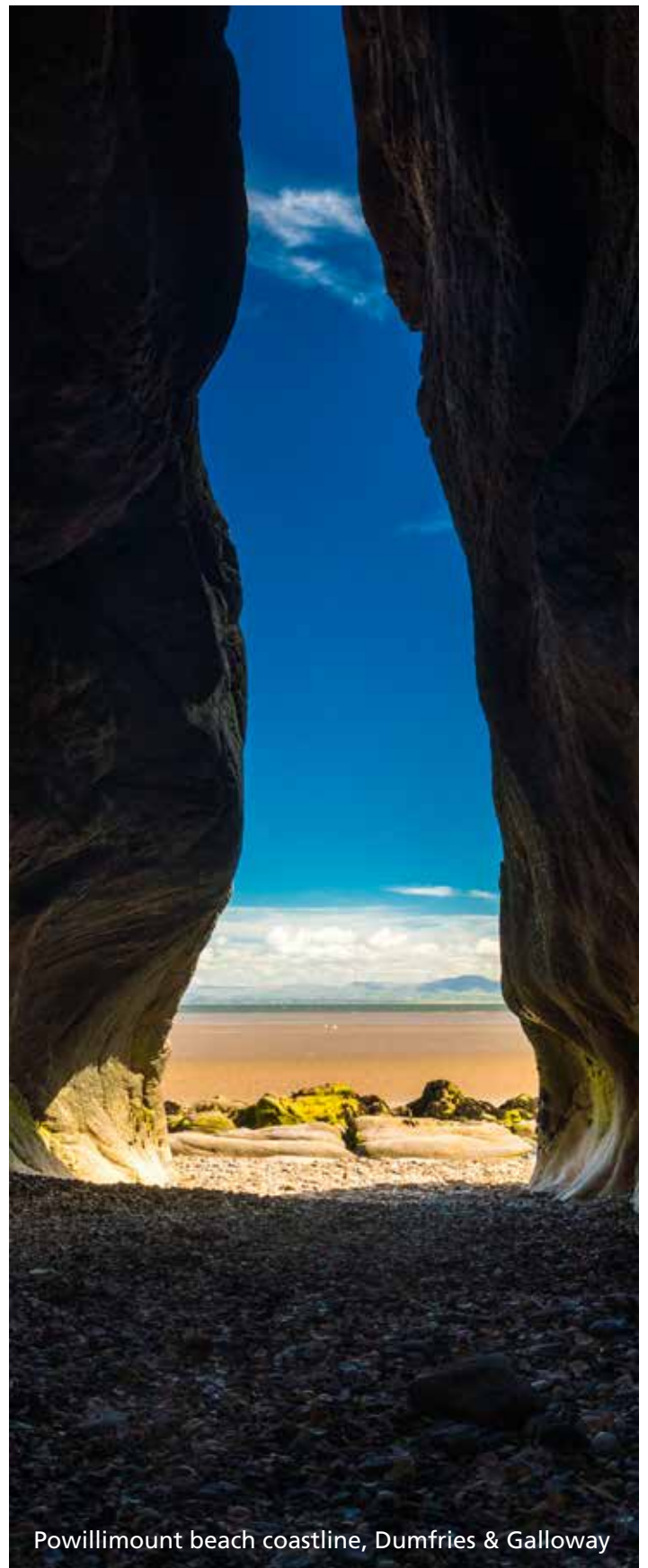
Powillimount beach coastline, Dumfries & Galloway

If you would like help understanding this or need it in another format telephone 030 33 33 3000